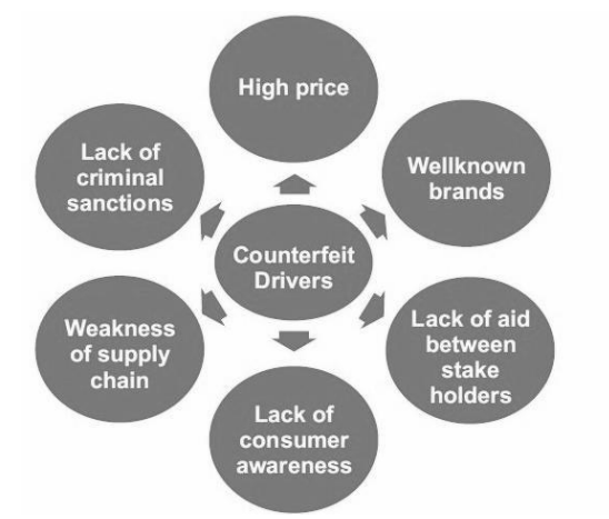
Fig. 1.1 Challenges in counterfeit elimination

We now have more fakes than real drugs in the market. I - Christophe Zimmermann, the anticounterfeiting and piracy coordinator of the World Customs Organization [6]. Current anticounterfeiting supply chains rely on a centralized authority to combat counterfeit products. This architecture results in issues such as single point processing, storage, and failure. Blockchain technology has emerged to provide a promising solution for such issues. In this paper, we propose the block-supply chain, a new decentralized supply chain that detects counterfeiting attacks using blockchain and Near Field Communication (NFC) technologies. Block-supply chain replaces the centralized supply chain design and utilizes a new proposed consensus protocol that is, unlike existing protocols, fully decentralized and balances between efficiency and security. Our simulations show that proposed protocol offers remarkable the performance with a satisfactory level of security compared to the state of the art consensusprotocol Tendermint.