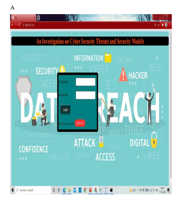
Figure 2: An Investigation on cyber threats and security models