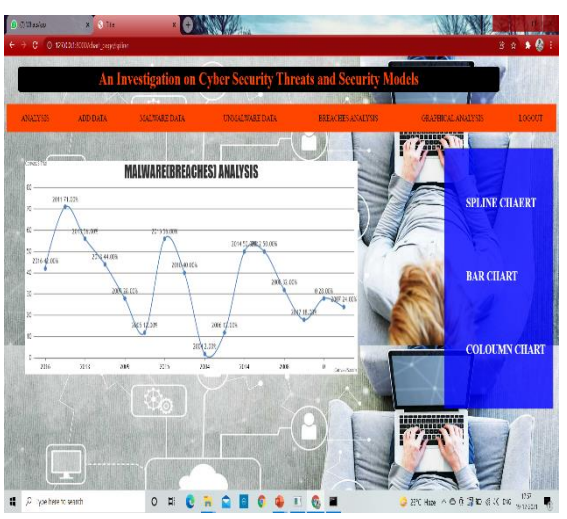
Figure 3 :Mallware breaches Analysis